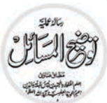
Masail e Fiqh