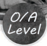
O & A Level