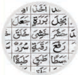
Quran / Qaida